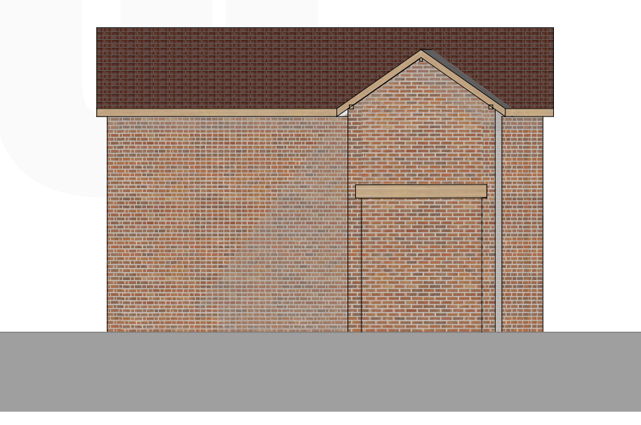
E4 Proposed Side Elevation 1:100